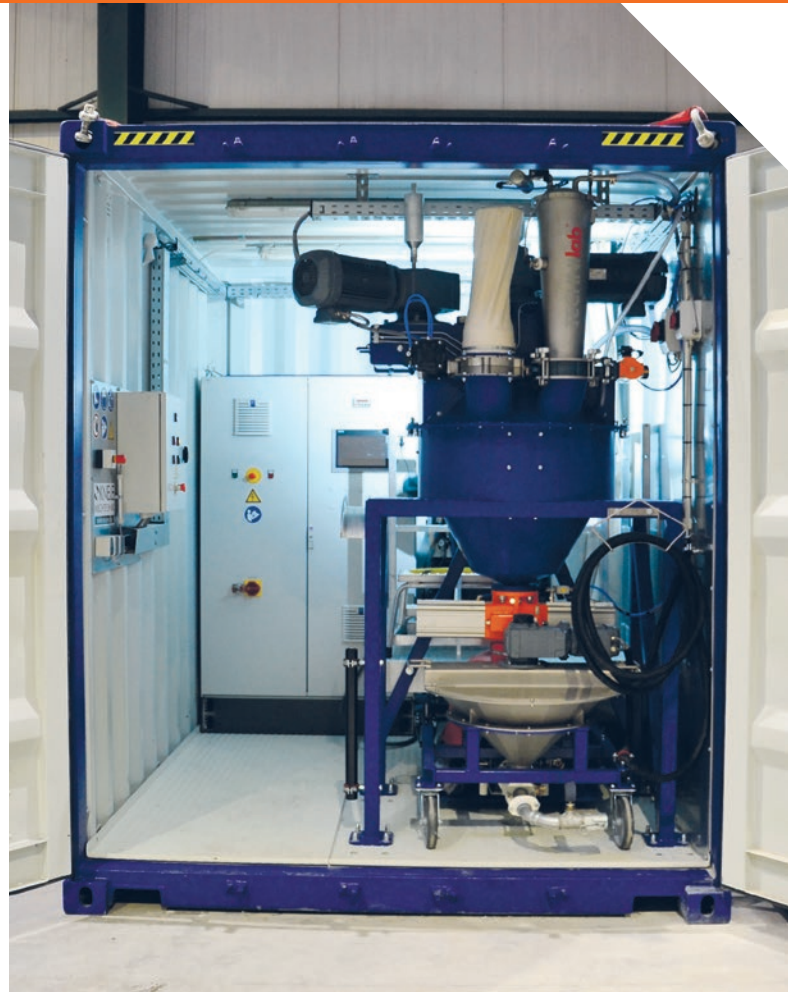
■ Designed as a mobile mixing plant, the Kniele conical mixer KKM 100/150 can be also installed in a deep-sea container.