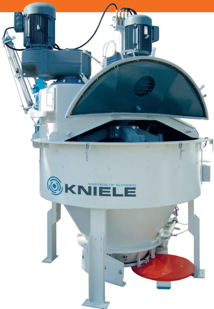
■ The Kniele cone mixers type KKM mixes very intensively and homogeneously

The Kniele cone mixers type KKM mixes very intensively and homogeneously. Quality concretes of all types such as self-compacting concretes, lightweight concretes; refractory, liquid adhesives, etc. can be produced within a very short time. The proven mixing technology ensures intensive and